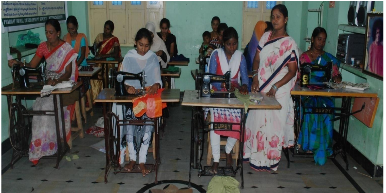
Stitching practice by the students under the supervision of Teacher

Tailoring was taught very well to the women and girls. The management was very good, under the super vision of PRDS Staff 90 more students were learn. Tailoring teacher gave good coaching to all of them.