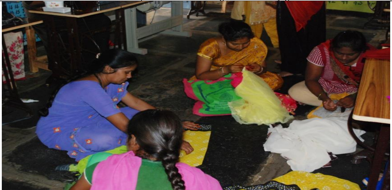
Cutting and stitching practice at Bukkapatnam Centre