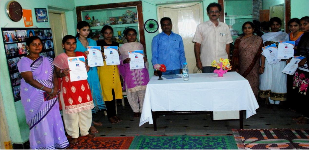
Students with Mandal Educational Officer