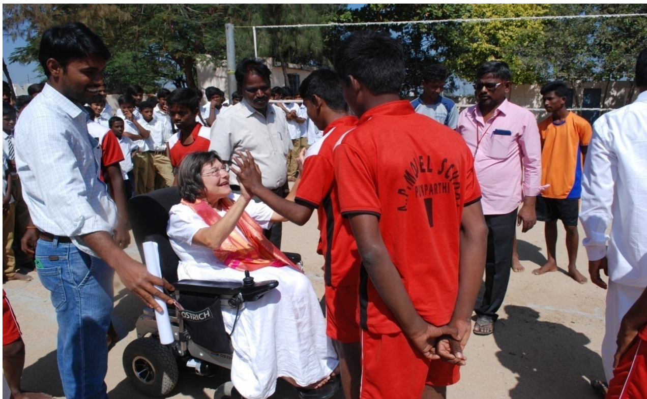
Interaction with sports teams