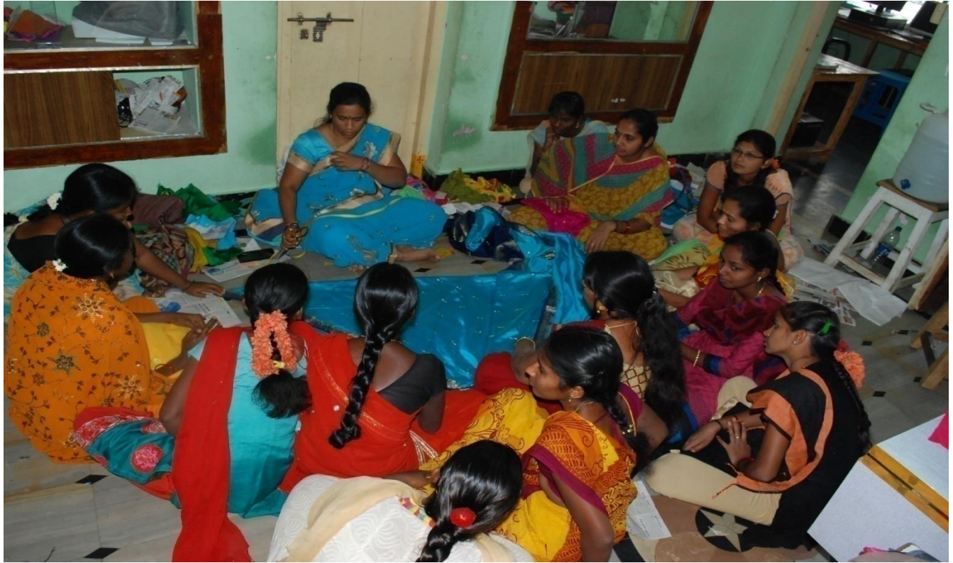
Practice of Cutting secession