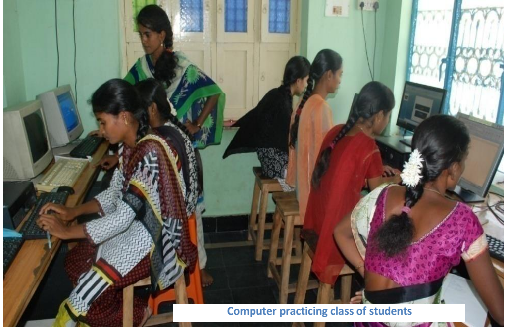
Computer practicing class of students

We started teaching tally course also (total Accounting Package) from 2 years. Tally ERP9 with GST is important to learn all the B.Com students and others also to get Bank jobs and for office works.