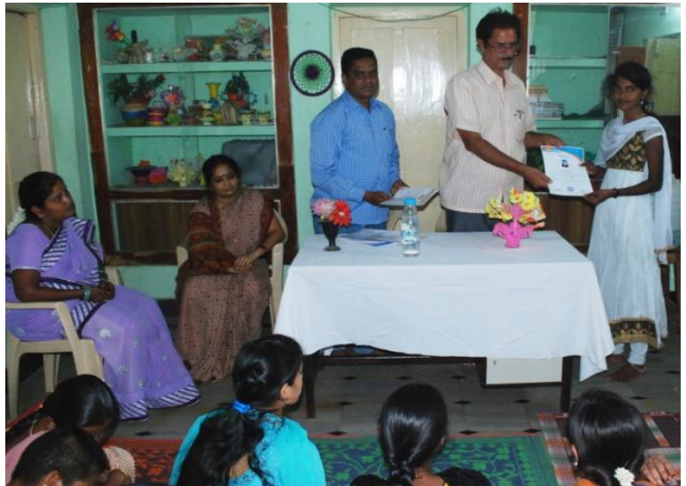
Students receiving the certificates from Mandal Educational Officer