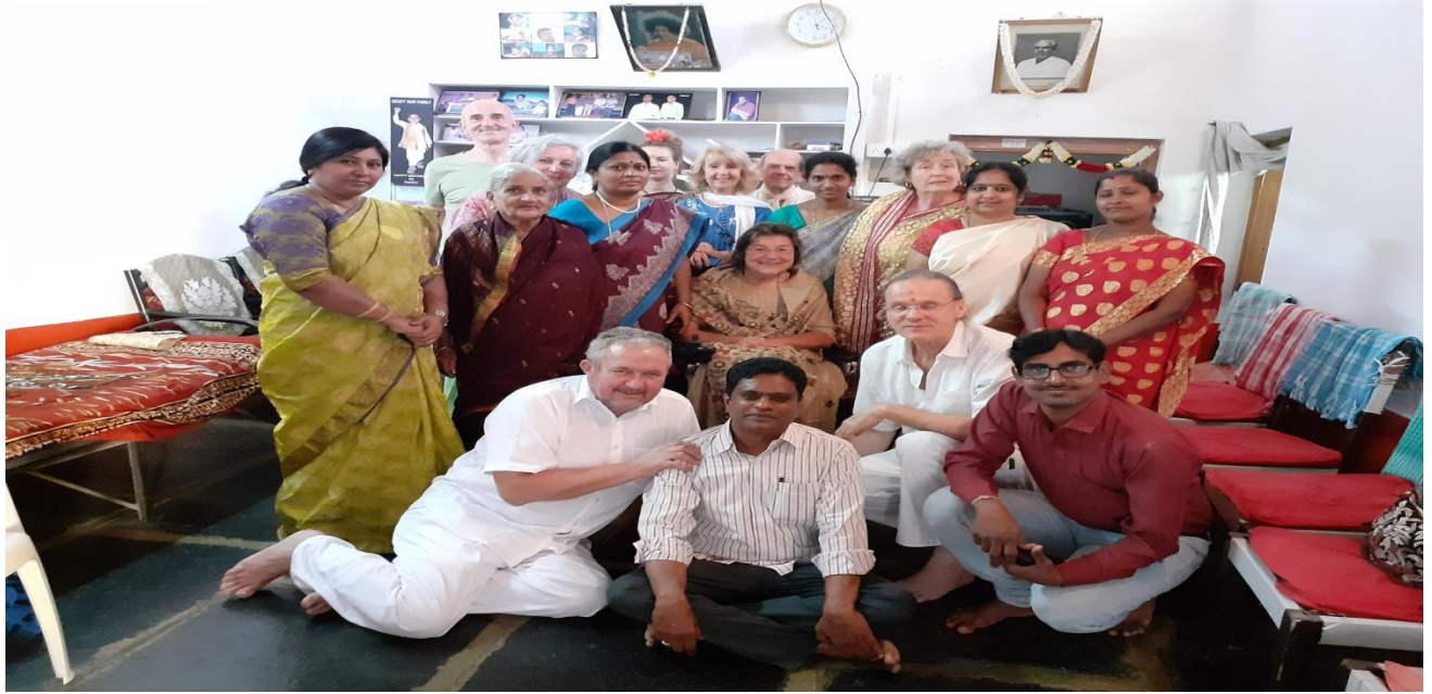
Warm welcome by children