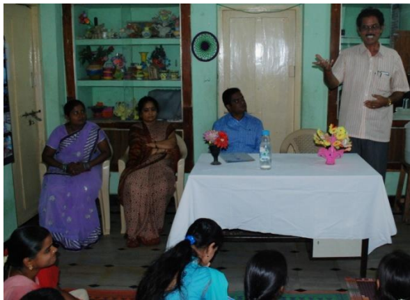
Mandal Educational Officer explain about skill development trainings

PRDS, Women support centre distributed the certificates to the Tally students.